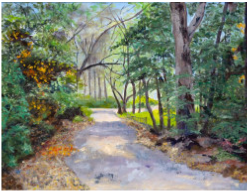
“A Walk on Christmas Day”

Some of my work in acrylics on canvas is currently on display at the Abbott Tract Artists gallery at: