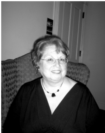
For the Social Dancer

Thank you, and see you on the dance floor!